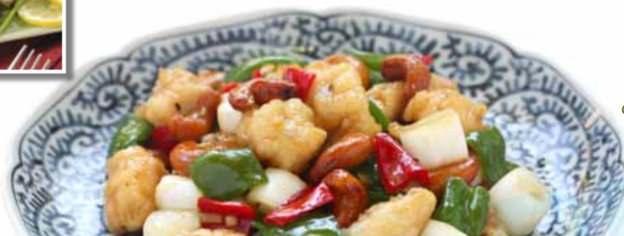
Cashew Nut Chicken