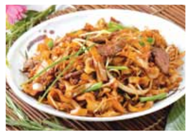
Beef Chow Fun