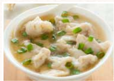
Wonton w/ Soup