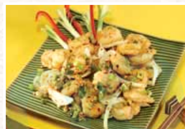
Salt & Pepper Shrimp