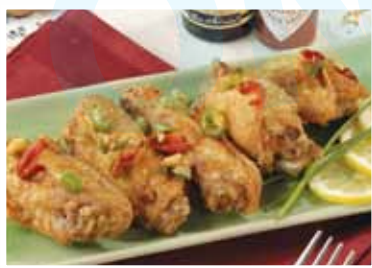
Salt & Pepper Chicken Wing