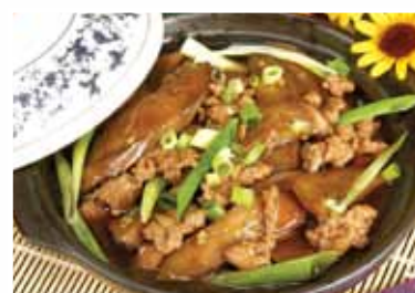
Spicy Eggplant Hot Pot