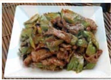
Beef with Bitter Melon