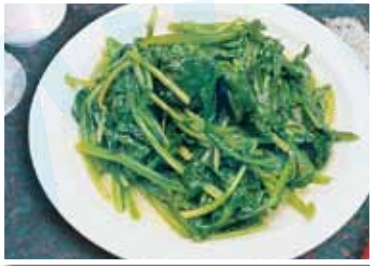
Sauteed Spinach w/ Garlic Bulb

Served with Steam Rice (Ham Fried Rice $1.00 Extra)