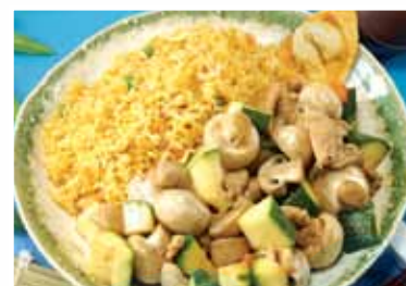
Moo Goo Gai Pan