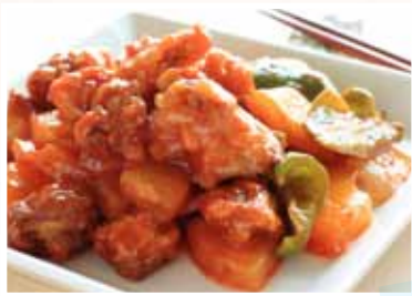
Hong Kong Style Pork Chop