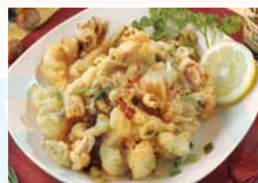
Salt and Pepper Squid