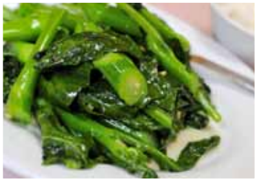
Chinese Broccoli w/ Oyster Sauce