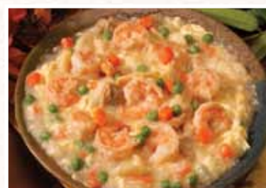
Shrimp w/ Lobster Sauce