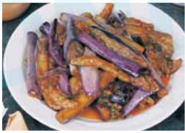
Eggplant w/ Szechuan Style