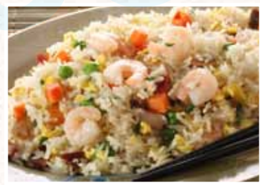
House Special Fried Rice