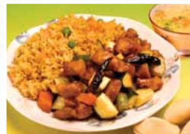
Kung Pa Chicken