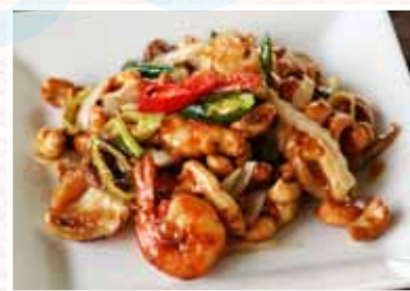
Kung Po Shrimp